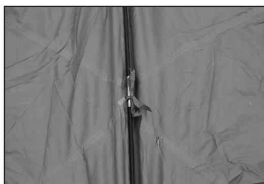
STEP 11 - Tie pole to the fly skin to secure.