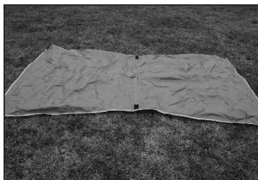
STEP 8 - Spread out the fly bottom side up.