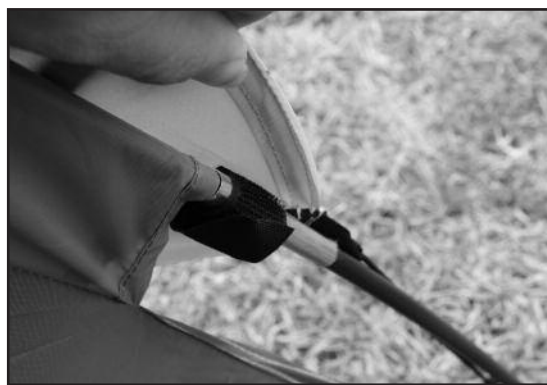
STEP 14 - Fasten velcro to poles.