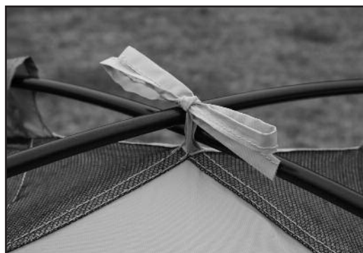
STEP 5 - Tie poles at the top of the tent.