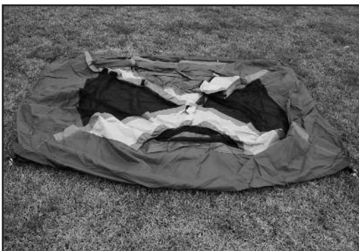
STEP 1 - Spread out tent skin.

Prepare your camp site by removing all sharp stones, twigs, etc. The site should be flat and have no depressions that could collect rain water.