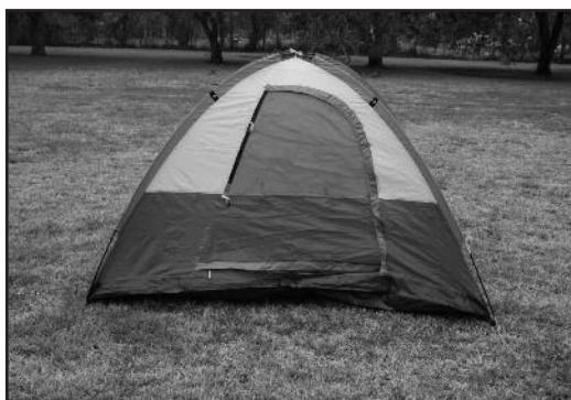
STEP 7 - This is what your tent should look like to this point.