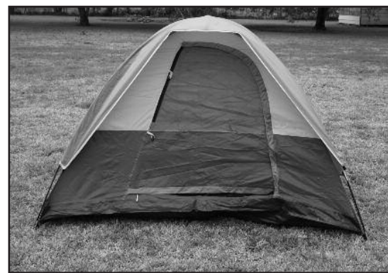
STEP 15 - Your assembled tent is now ready.