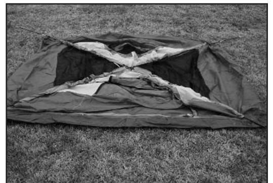
STEP 3 - Your poles should form an X as shown above.