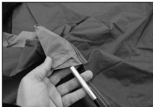
STEP 2 - Assemble the tent poles (D) and insert through the tent sleeves.