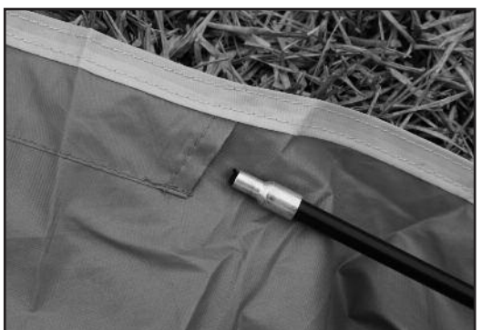
STEP 9 - Assemble fly awning pole (B) and push through the fly sleeve.