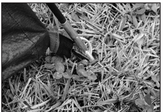
STEP 6 - Stake down at the ring.