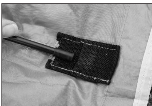
STEP 10 - Assemble the fly pole (C) and insert into web pockets.