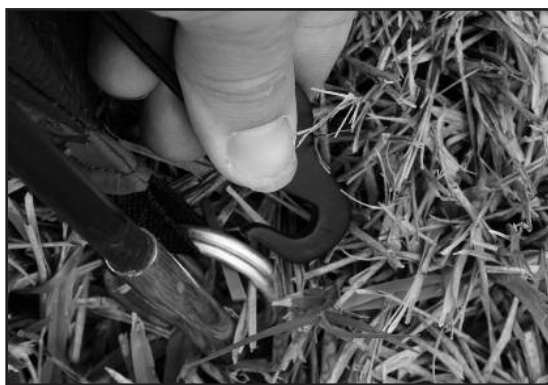
STEP 13 - Secure fly by attaching fly hook to ring.