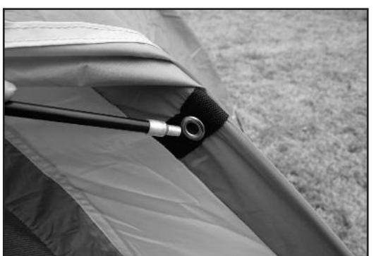
STEP 12 - Drape fly over tent and insert the awning pole into the grommets on tent skin to create an arch.