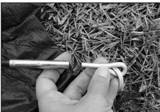
STEP 4 - Insert the pin and ring into the tent poles on all 4 corners.