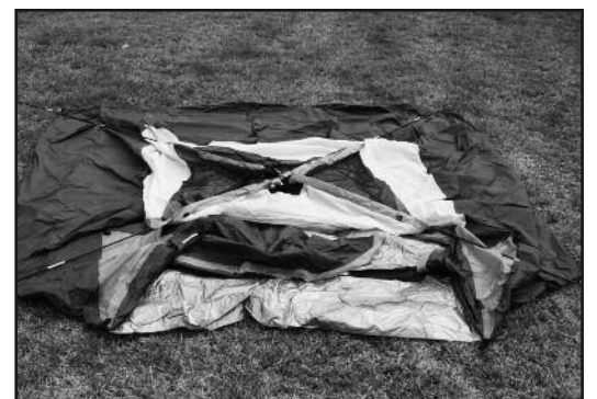
STEP 3 - Your poles should form an X as shown above.