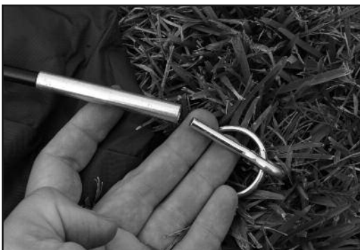
STEP 4 - Insert the pin and ring into the tent poles on all 4 corners.