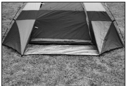
STEP 9 - This is what your tent should look like.