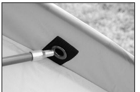
STEP 12 - Drape fly over tent and insert the fly pole into the grommets on tent skin to create an arch.