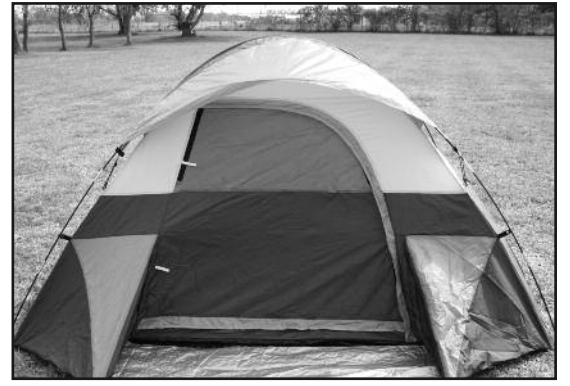
STEP 15 - Your assembled tent is now ready.