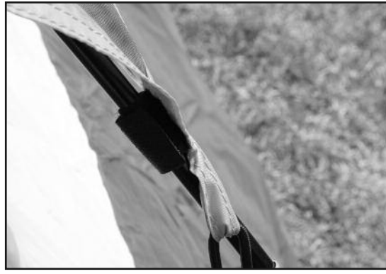
STEP 14 - Fasten velcro to poles.