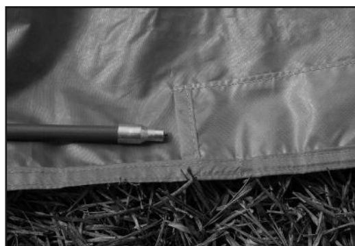
STEP 11 - Assemble fly pole (C) and push through the fly sleeve.