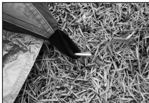
STEP 8 - Stake down tabs at the foot locker base.