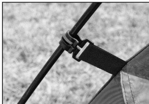
STEP 5 - Secure skin by snapping all speed clips onto the tent poles.