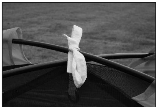
STEP 6 - Tie poles at the top of the tent.