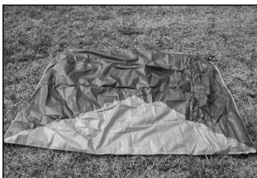
STEP 10 - Spread out the fly upside down.