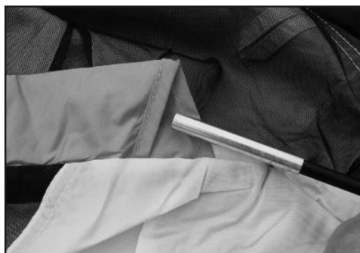
STEP 2 - Assemble the tent poles (B) and insert through the tent sleeves.