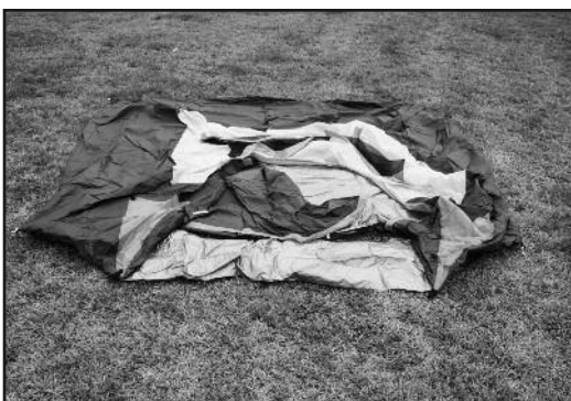
STEP 1 - Spread out tent skin.