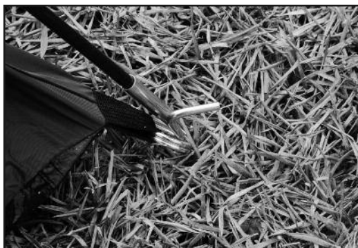
STEP 7 - Stake down at the ring.