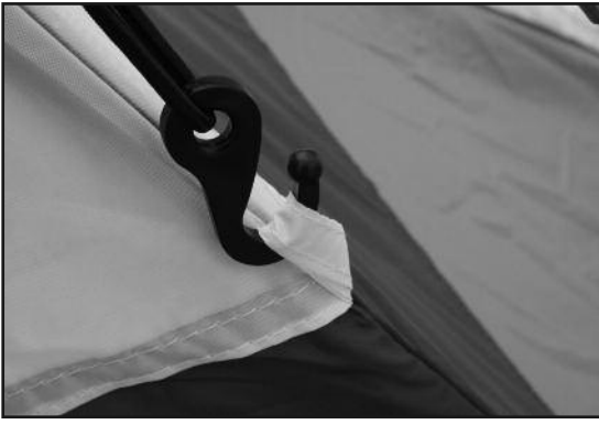
STEP 13 - Secure fly by attaching fly hook to loops on tent skin.