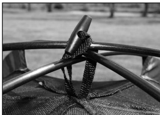
STEP 4 - Secure tent to poles with attached toggle.