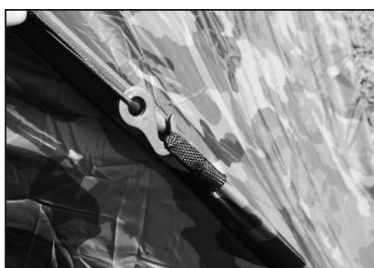
STEP 7 - Drape the rainfly over the tent and secure it by attaching the fly hooks onto the loops on the tent.