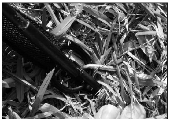
STEP 5 - Stake down at the ring on all corners.