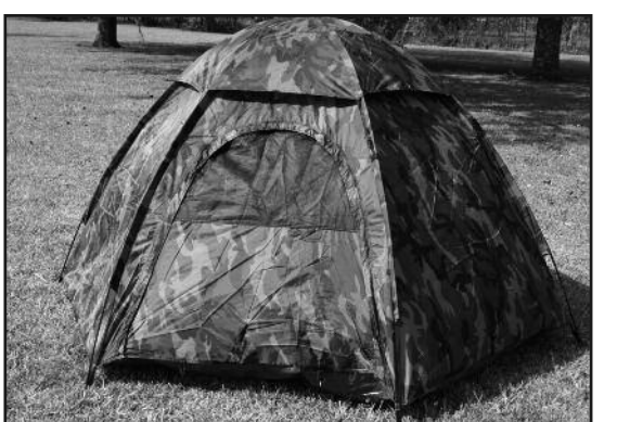
STEP 8 - This is what your tent should like with the rainfly.