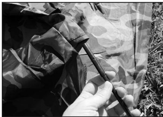
STEP 2 - Assemble the tent poles (A) and insert through the tent sleeves.