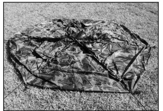
STEP 3 - Your poles should form a "star" as shown above.