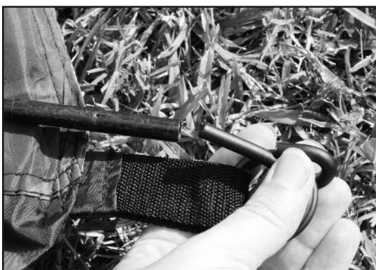
STEP 4 - Insert the pin and ring into the tent poles.