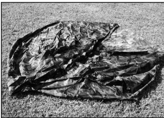
STEP 1 - Spread out tent skin.