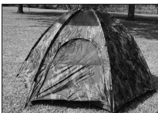
STEP 6 - This is what your tent should like without the rainfly.