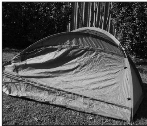
STEP 2 - Push the 2 long poles into the criss-cross sleeve sections of the tent skin. This is what your tent should look like without the rainfly.