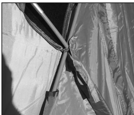
STEP 5 - Tie the front pole at the sides to secure to the tent skin.