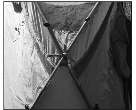
STEP 3 - Tie the back poles to tent skin to secure.