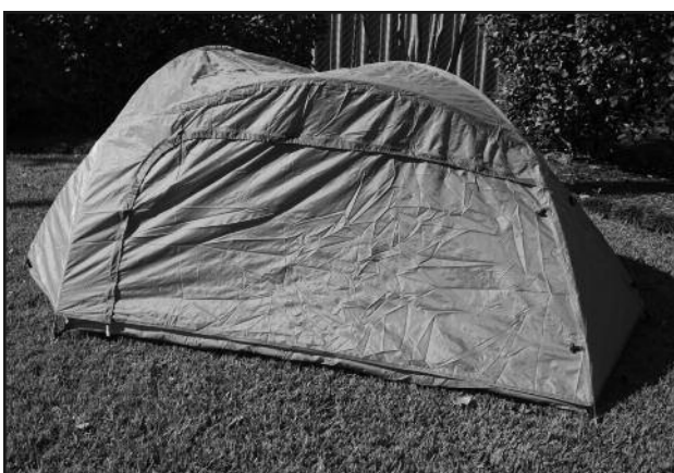
STEP 7 - Attaching the rain fly: To make it easier; match up the doors on the fly with the doors on the tent and drape over tent.