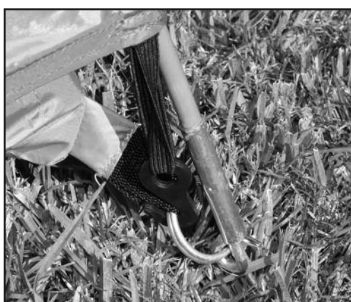
STEP 8 - To secure the rain fly, attach the hooks onto the rings.