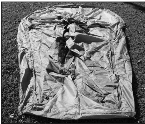
STEP 1 - Spread out the tent skin and assemble the poles.

Prepare your camp site by removing all sharp stones, twigs, etc. The site should be flat and have no depressions that could collect rain water.