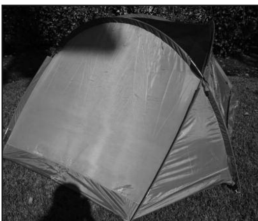
STEP 4 - Push the short pole through the remaining sleeve in the front of the tent.