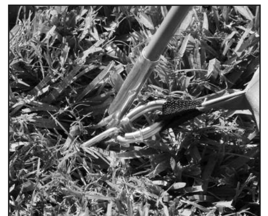
STEP 6 - Insert the pins into the bottom of the 2 long poles first. Then the short pole. In this order, it is easier to stretch the tent skin. Stake down at all 6 corners.