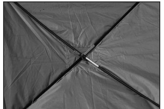
STEP 3 - Your poles should form an X as shown above.