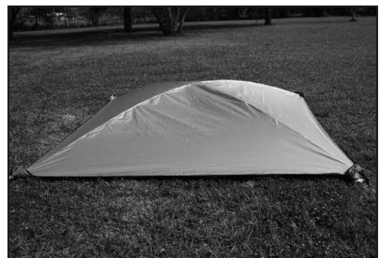
STEP 6 - Carefully flip the roof over.