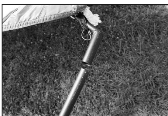
STEP 7 - Assemble the 4 chain-corded legs (B) and insert into the large molded pole joint.