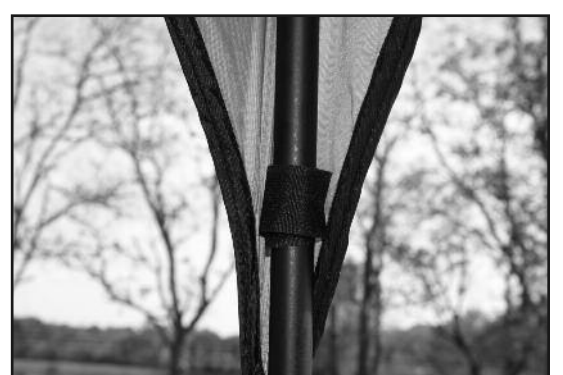
STEP 9 - Velcro roof panel to the legs to secure.