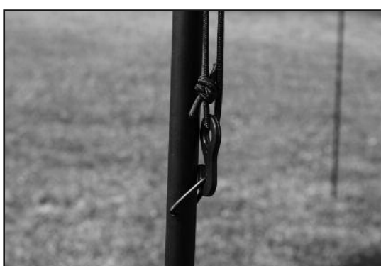
STEP 8 - Attach the roof hooks on the roof panel to the leg tabs.