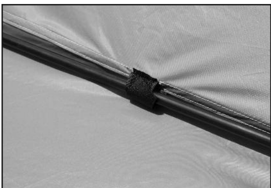
STEP 4 - Velcro poles to secure to dining canopy skin.