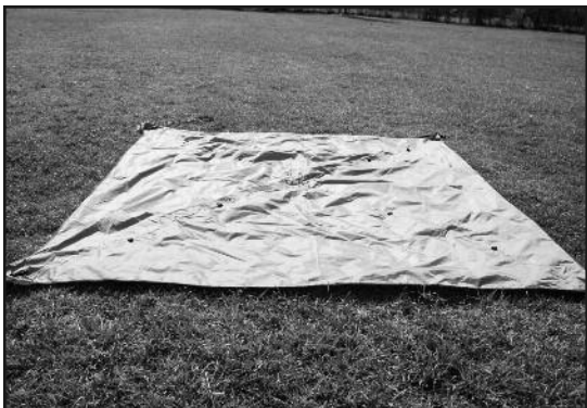
STEP 1 - Spread out dining canopy skin.

Prepare your camp site by removing all sharp stones, twigs, etc. The site should be flat and have no depressions that could collect rain water.