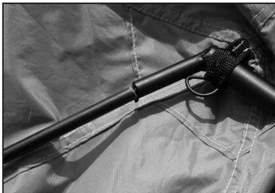
STEP 2 - Assemble the 2 long dining canopy poles (C), and insert into the small molded pole joints