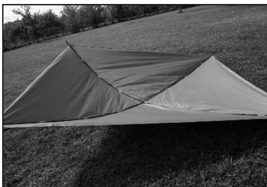
STEP 5 - This is what your canopy roof looks like at this point.