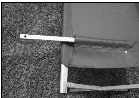
STEP 5 - Insert the short end section into the cot sleeve.