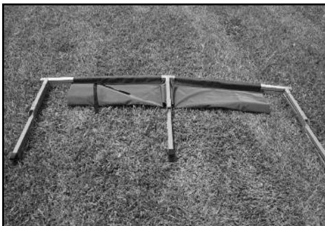
STEP 2 - Fold down leg supports against bed section side frames.