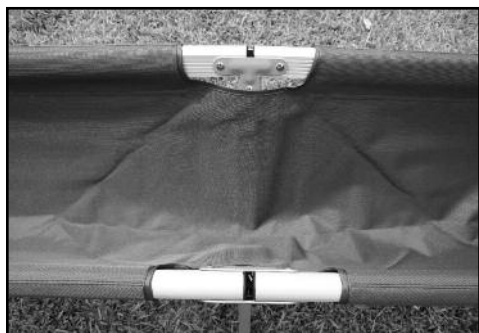
STEP 4 - With the cot frame half open, adjust the cot fabric so that it is centered on the frame. This allows the short end frame section to attach easily.