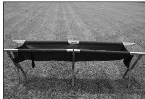
STEP 3 - Pull frame slightly apart and stand on legs.