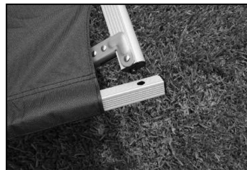
STEP 6 - Insert attached frame pins into corresponding holes on end sections to secure.