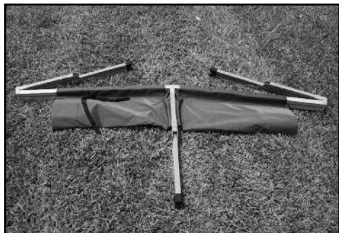
STEP 1 - Unfold cot.