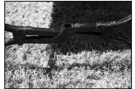
STEP 3 - Open cot all the way, and push down to lock legs.