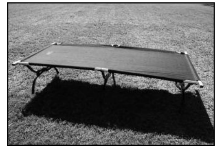
STEP 6 - Enjoy