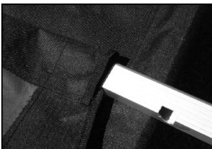
STEP 4 - Insert one end frame section into the cot sleeve.