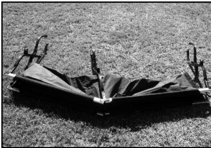
STEP 1 - Unfold cot and pull back legs.