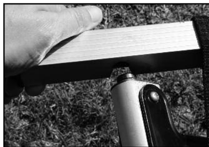
STEP 5 - Insert attached frame pins into corresponding holes on end sections to secure. Repeat this for the other end of the cot.