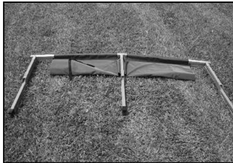
STEP 2 - Fold down leg supports against bed section side frames.