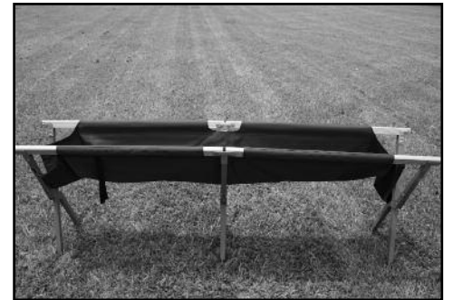
STEP 3 - Pull frame slightly apart and stand on legs.