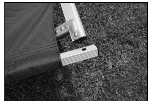
STEP 6 - Insert attached frame pins into corresponding holes on end sections to secure.